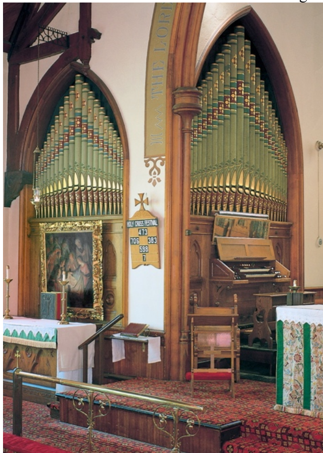
Our Merciful Savior Church